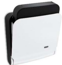
Customer end unit XON1300

Titel: Stable performance despite home office and streaming