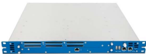
SAT Headend NEO P-Serie

HUBER+SUHNER BKtel has a broad product portfolio for RF video overlay solutions for any fiber optic network. Centrally, the desired TV and radio programs are received from different satellites by the NEO processing series and transmodulated into digital cable TV channels. An optical transmitter converts the high-frequency signals into light signals and feeds them into the fiber optic network. As light-based transmission has almost no loss of quality or latency, transmission of over 100 km is possible. The reconversion of the optical signals takes place at the end customer. For this purpose, HUBER+SUHNER BKtel has developed the XON series of termination units that fit different customer requirements (TV and/or Internet). With "RF Video Overlay", every subscriber has access to a comprehensive and stable TV package and maximum Internet bandwidth, even at peak times.