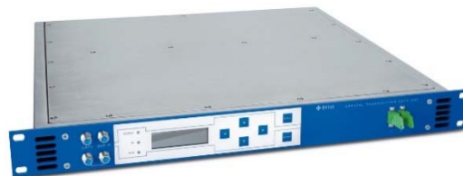
Optical Transmitter ES10